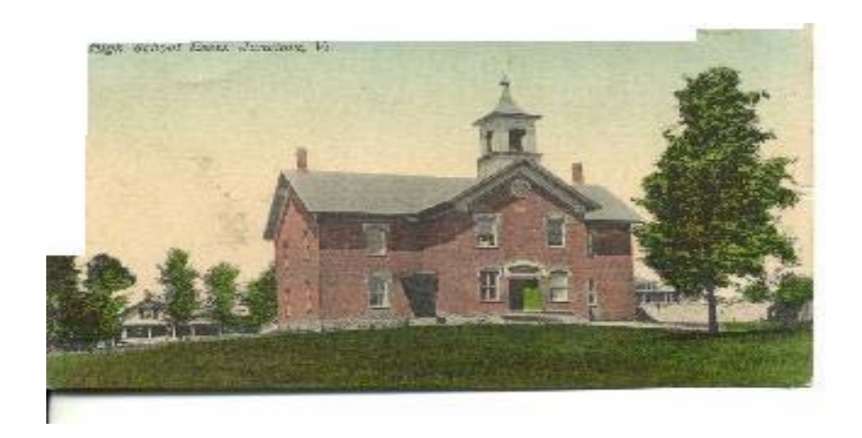
The Park Street School was built for $8,000 in 1873. It was never just a high school, but always a mix of graded and secondary classes.

In 1872, Essex Junction Graded School, so called, was chartered by the Legislature, and in the year following the present commodious and well-arranged school building was erected upon the large and ample grounds, which surround it. It was built at a cost of nearly eight thousand dollars, by a tax upon the grand list of the district. It has three grades - primary, intermediate, and grammar - and is well sustained. Thus the scanty means of education enjoyed by the girls and boys of 1796 have been multiplied and improved as the progress of civilization and population demanded. With all its schools and privileges, Essex ought to be in advance of its neighbors.<sup>5</sup>